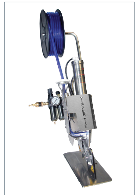
SP100 clipper with optional blue clips.

Both vertical and horizontal models are available with plastic spooled clips in white or one of three colors. Spooled clips provide longer, more efficient operation. P-120SP is the standard white clip. Colored clips require a minimum order of one million and are available in blue (P-130SP), purple (P-140SP) and pink (P-150SP).